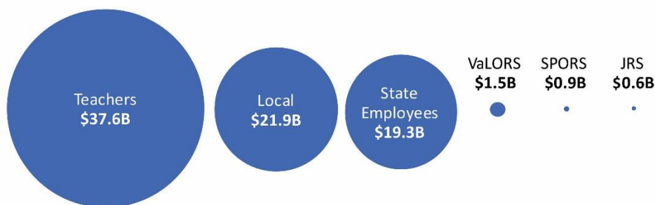
FIGURE 1 VRS pension assets by plan

Investment income is critical to the health of the VRS trust fund, typically accounting for over half of total additions in recent years. However, in FY20 investment income accounted for less than one-third of total additions. More recently, investment income increased significantly, and VRS investments generated a return of 28.3 percent for the one-year period ending March 31, 2021. The total annualized return over the 10-year period ending March 31, 2021 was 8.3 percent, which is well above the 6.75 percent long-term (30+ year) rate of return that VRS assumes for its investments.