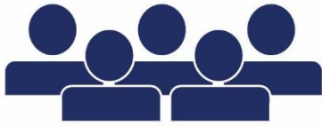
FIGURE 2 VRS fast facts